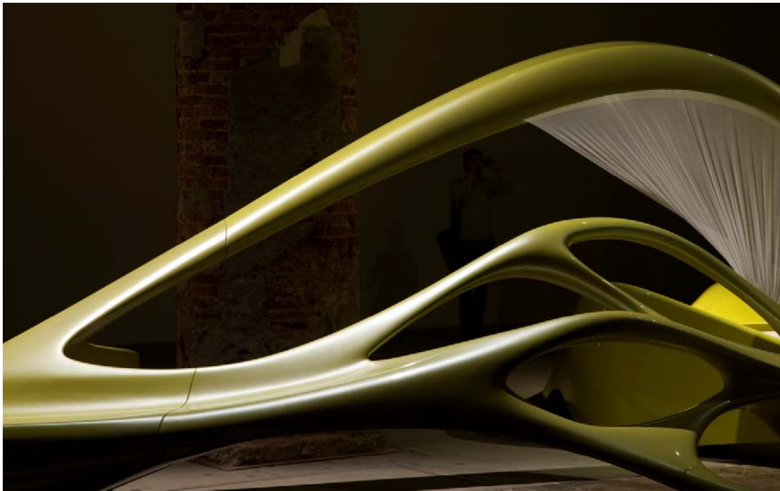
Lotus, designed by Zaha Hadid for the 2008 Venice Architecture Biennale