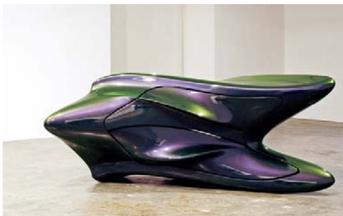
Swash Cabinet, part of the Seamless Collection, designed by Zaha Hadid for Established & Sons